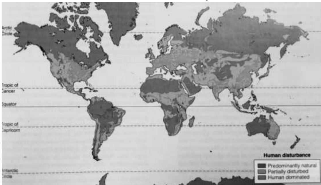
Human Disturbance Map